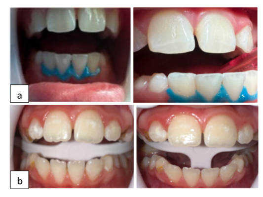
Fig. 1. Photos of the subjects before and 6 months after the treatment.